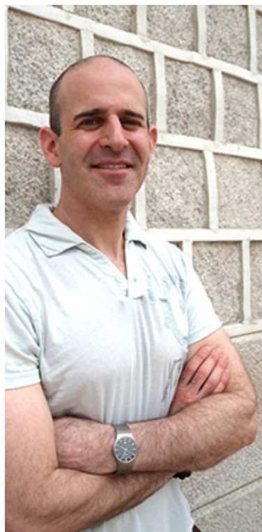
. assistant professor of history, is principal investigator on

Five-year, $600,000 grant from the Academy of Korean Studies aims to build interdisciplinary, comparative scholarship of Korea